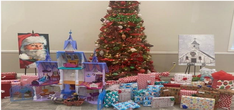
Project Joy & Hope

NAII Houston is honored to partner with Project Joy & Hope. Project Joy & Hope is a non-profit organization located in Pasadena, that helps house and support families with seriously ill children. With the help of our generous employees, NAII was able to provide gifts to one of the families, making this time of year one of joy and hope!