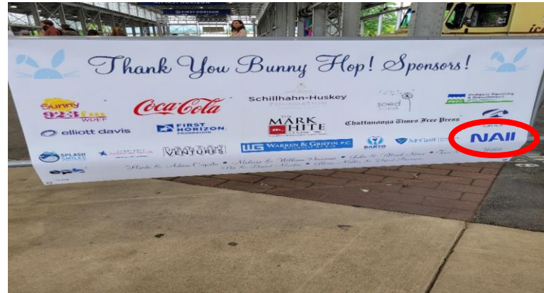
Chambliss Center for Children